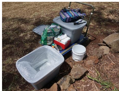
Congratulations on your creative method of bringing water for Kūkaniloko plants.