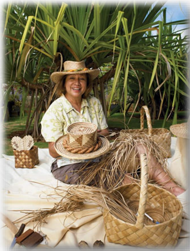
2k8 Photo credits nā Kalimapau

Nā Mea Hawai‘i are Now Being Labeled | ‘Ōiwi TV